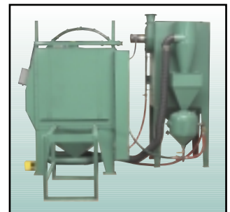
Dust collector and media reclaimer redesigned to fit into compact footprint.