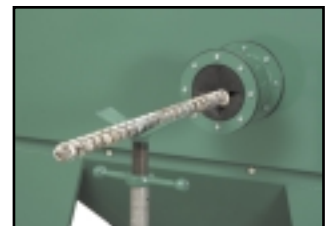
Specialized port allows easy cleaning of feed screws.